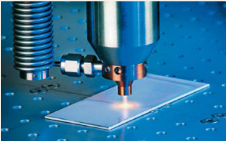
The system uses the jet principle to activate and coat surfaces.

A major supplier to the automotive industry has recently begun using plasma technology to pretreat pump housings. With the new process, the surfaces of metallic components can be selectively coated in-line at atmospheric pressure to prevent bond line corrosion.