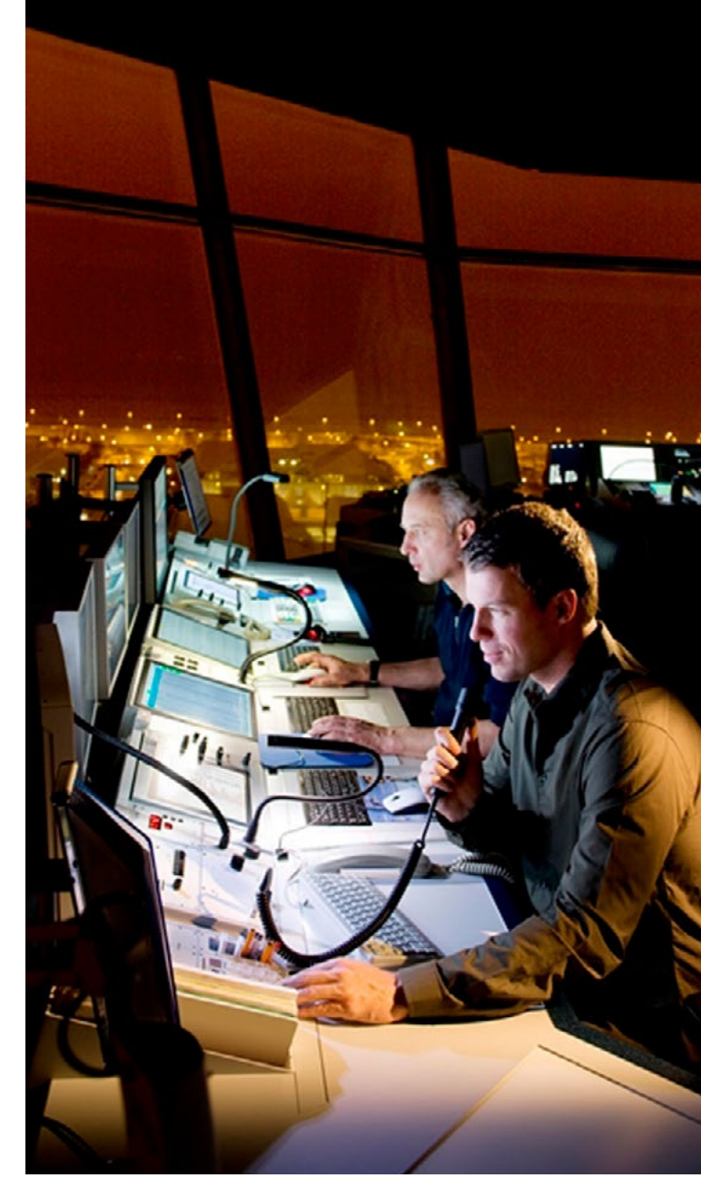
Figure 1: The safety of billions of air travelers depends on uninterrupted radio communication between air traffic controllers and pilots.

Rohde & Schwarz, a manufacturer of wireless communications and EMC test and measurement equipment, and broadcasting and T&M equipment for digital terrestrial television, also