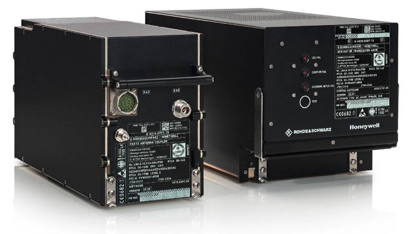
Figure 5: The XK/FK 516 shortwave radio guarantees airborne communications. The FK 516 antenna tuning unit with built-in tuning control (left); the matching amplifier (right).

of eight-hour cooling and heating cycles; after a four-hour cooling cycle at -55°C, the temperature in the burn-in chamber is pushed up to +70°C in a matter of a few minutes and held for a further four hours before plunging back down equally rapidly to start the next cooling cycle.