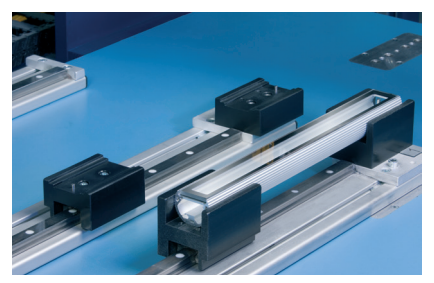
>>5: Bonding the housing of surface-mounted machine lights – application of adhesive to the plasma-treated groove in the aluminum housing (top), a suction cup transports the plasmatreated glass panel to the adhesive bead (middle), the bonded housing (bottom)

In autumn 2015 the environmentally friendly process was integrated into series production. Its use has eliminated two entire process steps, and also dispensed with the need for drying times and interim storage. The plasma system equipped