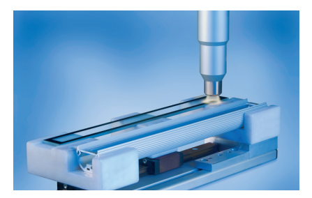
>>4: One plasma nozzle, three materials – cleaning and activation of the PMMA plastic panel (top), microfine plasma cleaning of the aluminum housing (middle) and Openair-Plasma treatment of the safety glass panel (bottom)

assemblies and other delicate electronic components.