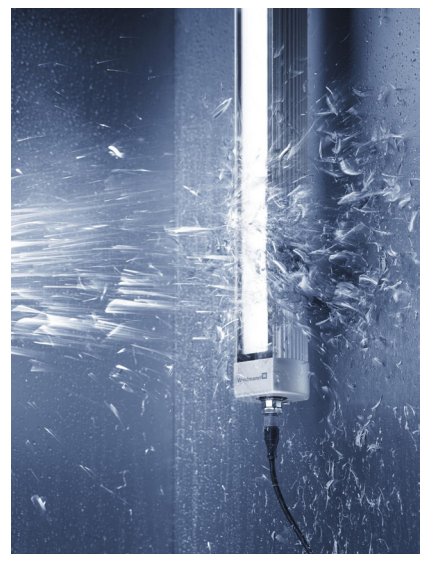
>1: Surface-mounted machine lighting must withstand tough conditions and the requirements for seal tightness are extremely high

The use of wet-chemical substances that are harmful to the environment for the pretreatment of material surfaces is still one of the most widely used application methods in the industry. It was no different here. For years, an employee working in a separate room cleaned the adhesive surfaces manually using a cotton cloth soaked in solvent-based isopropanol and a plastic cleaner. He then inserted the parts in an automatic priming station, where thev were treated first with an activator and then again with a chemical adhesion promoter using a felt applicator. The next step was to remove the parts and air-dry them, then finally transport them by trolley a distance of 10m to the bonding station.