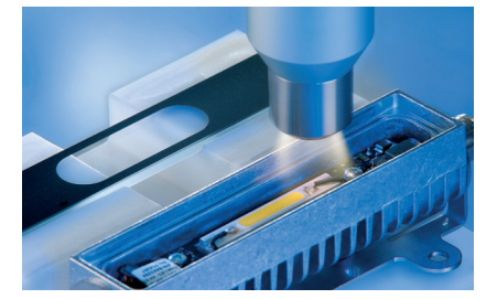
>2: Environmentally friendly, adhesion-enhancing and harmless to electronics: Instead of wet chemicals, the machine lighting housing is now pretreated with Openair-Plasma before bonding

on a plasma nozzles system >>2. Twenty years ago, the systems engineer succeeded in integrating a state of matter up till then scarcely used in industry into in-line production processes and so making plasma under normal pressure feasible on an industrial scale for the first time. The technology, now deployed throughout the world, lead to the creation of a pretreatment process requiring nothing other than compressed air as the process gas and electrical energy. This prevents the emission of VOCs (vola-